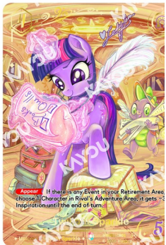
❖ BP01-CR01 Twilight Sparkle