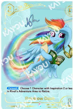
❖ BP01-CR05 Rainbow Dash