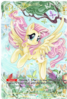
❖ BP01-CR02 Fluttershy