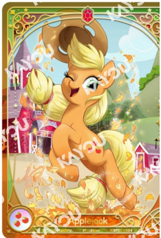
❖ BP01-RR04 Applejack