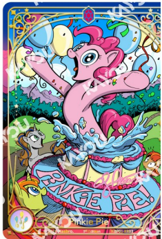
❖ BP01-RR03 Pinkie Pie