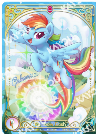
*BP01-RR05 Rainbow Dash

"Velvet-lined display, not a bulk binder."