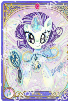
❖ BP01-RR06 Rarity