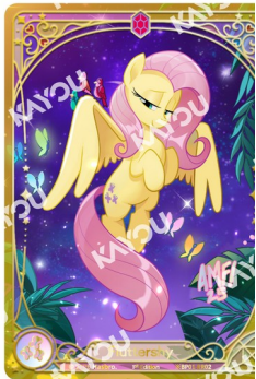
❖ BP01-RR02 Fluttershy