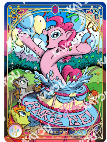
*BP01-RR03 Pinkie Pie