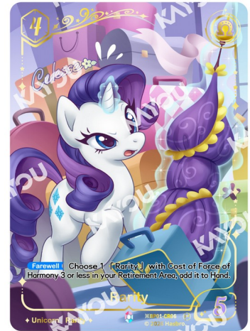
✧ BP01-CR06 Rarity