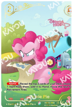
❖ BP01-CR03 Pinkie Pie