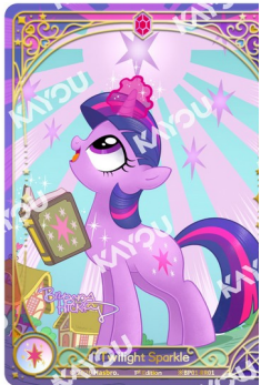
❖ BP01-RR01 Twilight Sparkle

Twelve Shining chase cards define the full harmony binder – six RR Shining Ruby (1/32 boxes) and six CR Shining Colorful (1/8 boxes). Pin this page to the inside of your binder.