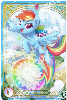
❖ BP01-RR05 Rainbow Dash