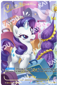
❖ BP01-CR06 Rarity