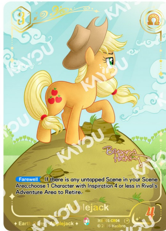
✧ BP01-CR04 Applejack

Stained-glass palette. Studied magic, made fabulous.