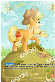
❖ BP01-CR04 Applejack